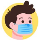
EPiC crews and riders wear masks

We're keeping our deliveries CLEAN & SAFE for you