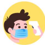
Frequent temperature checks