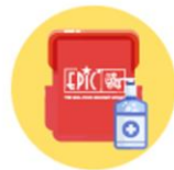
Sanitised EPiC delivery bags