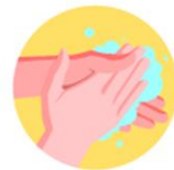
Increased hand washing