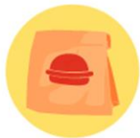
Zipped takeaway bags